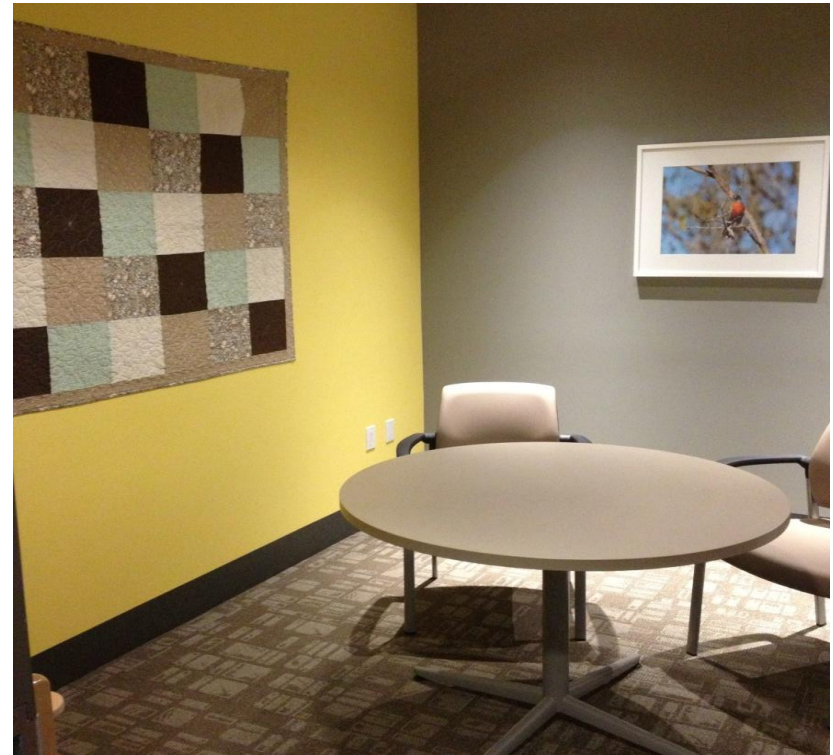
Forensic Interview Room