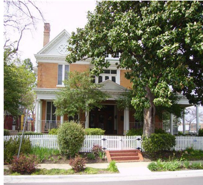
Dallas Children's Advocacy Center 3611 Swiss Avenue Dallas, Texas *Former Location