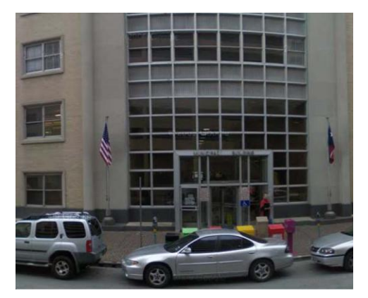
2014 Main Street (Municipal Building Annex)