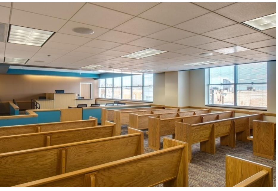
Upper Floor Lobby Courtroom