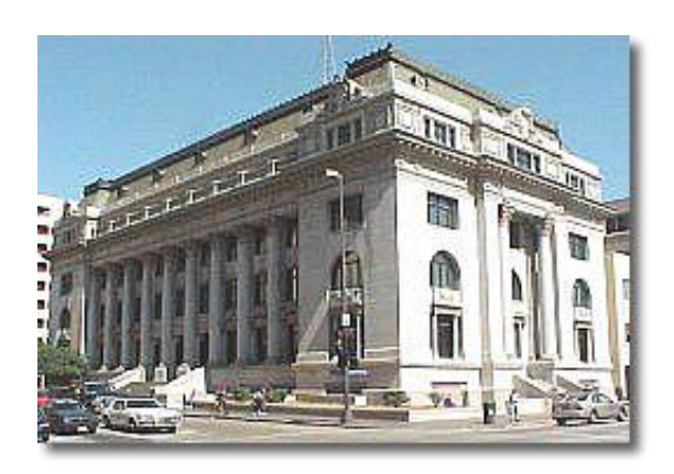
106 S. Harwood Street (Municipal Building)