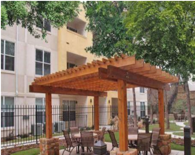
Providence Mockingbird Apartment Homes