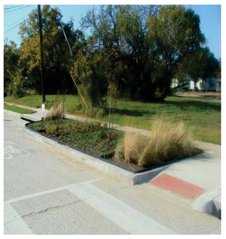
Herbert Street (West Dallas) Traffic Calming Completed Winter 2012