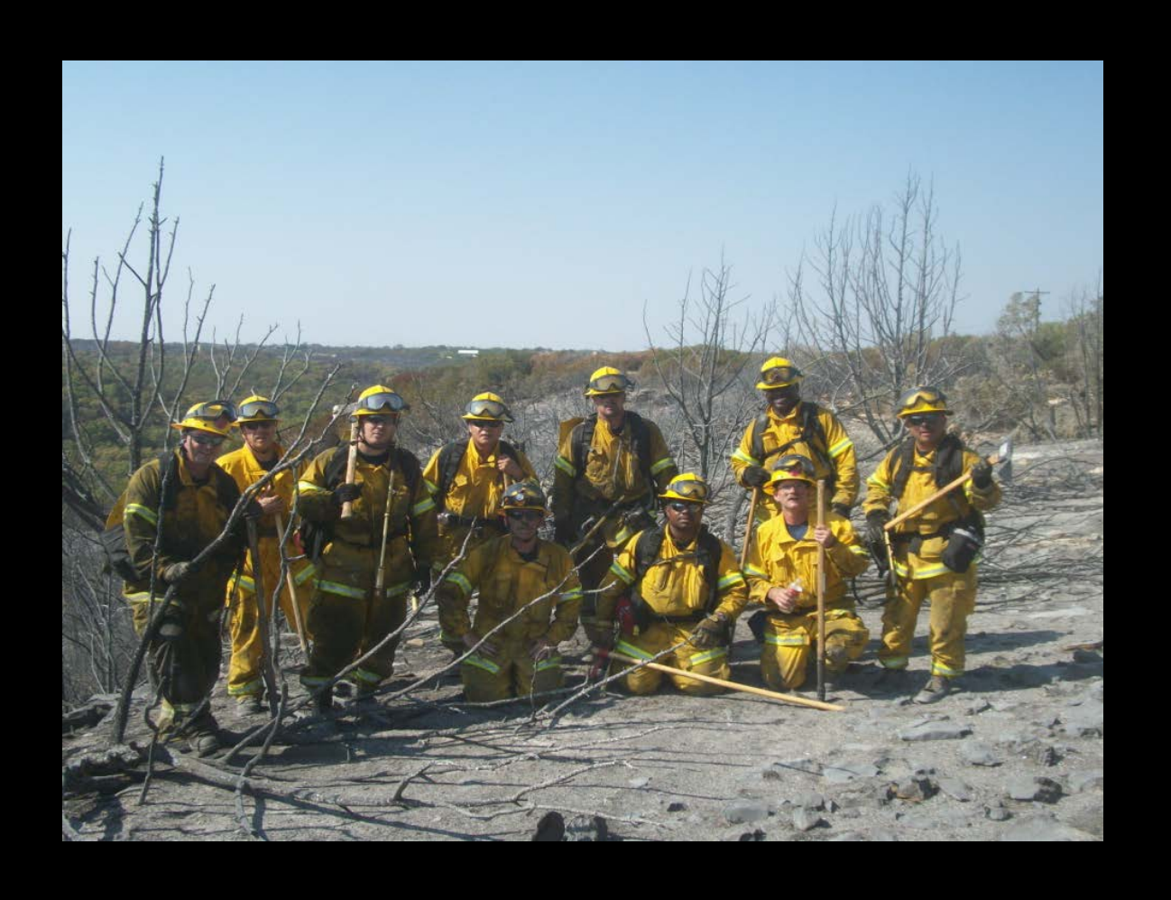
Dallas Fire Module