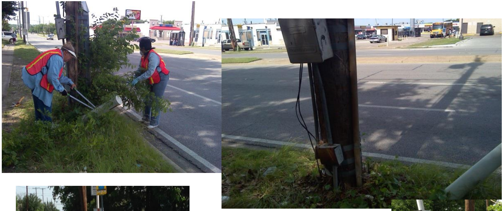
Bishop Arts Neighborhood Association (District 1)