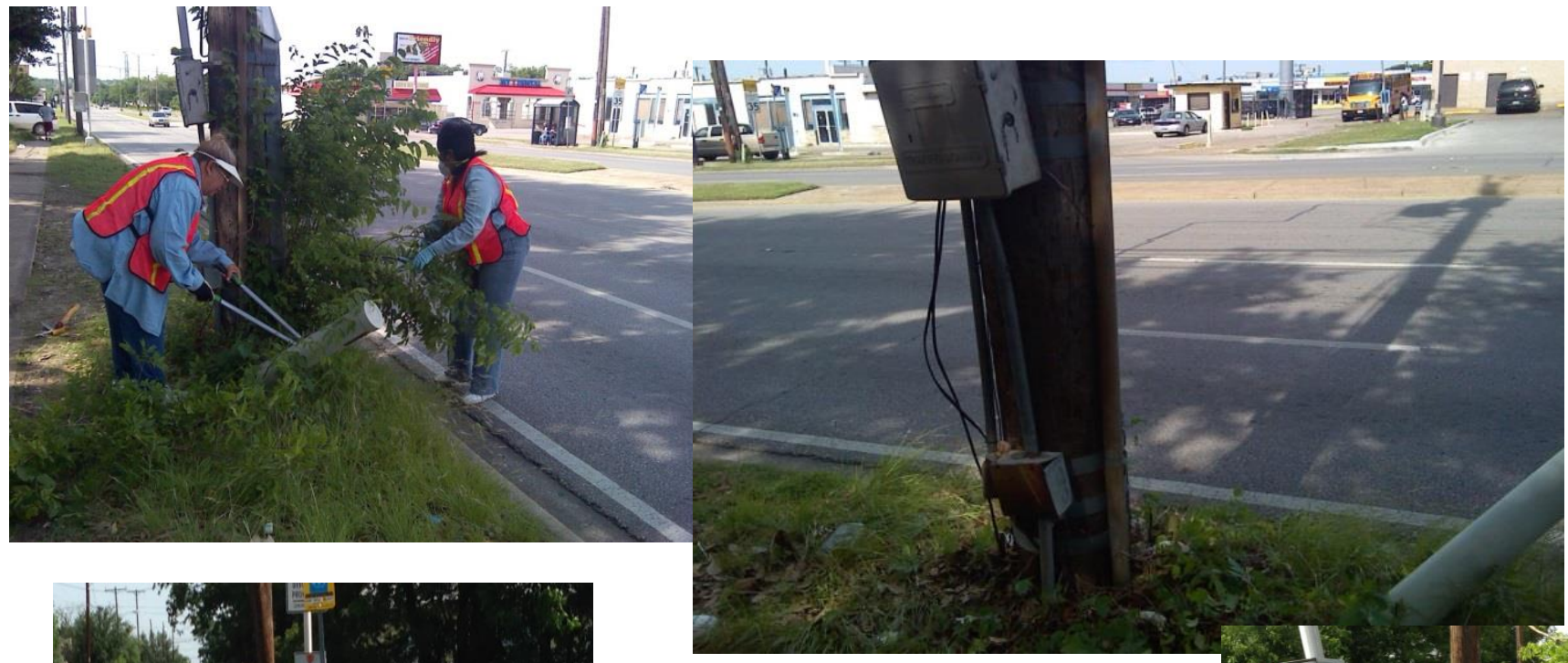
Bishop Arts Neighborhood Association (District 1)