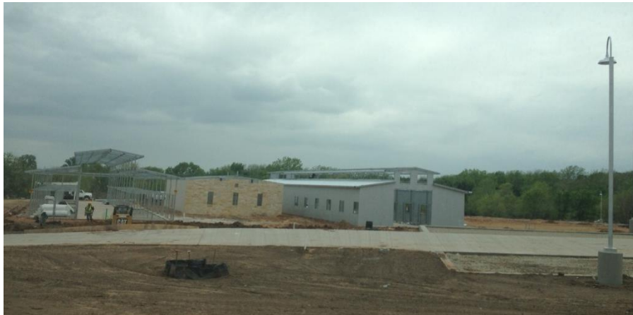
Barn and Tack Room

Includes Offices, Reception Area, Conference Room, and Hippotherapy Rooms