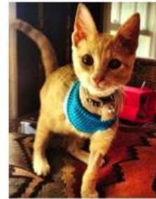
"Peanut" Lost a leg but found the perfect home