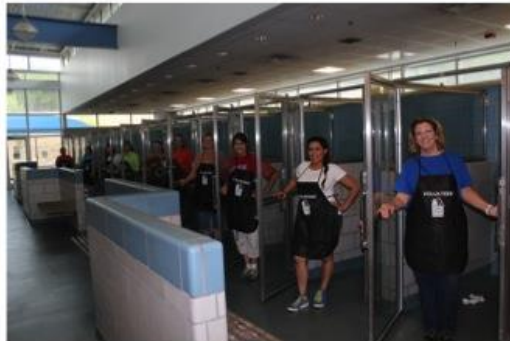
Empty the Shelter Day – 149 adoptions in One Day