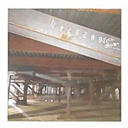
New structural support steel was fabricated and it is installed on levels 6-7 (pictured level 7)