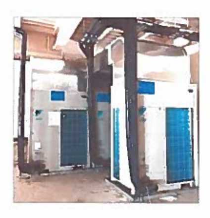
28 high energy efficient VRV HVAC units are installed