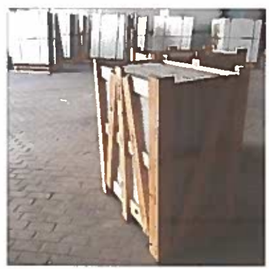
Marble slabs are catalogued and prepared for shipment to refurbishing plants. 20% have been refurbished and first shipments have arrived on site.