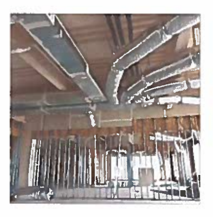
Mechanical rough – ductwork is installed on 12 apartment floors