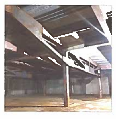
New structural support steel was fabricated and it is installed on levels 6–7 (pictured level 6)