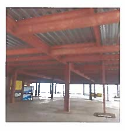
New steel structure installed on fl. 9 (amenity deck) & 10 (above)