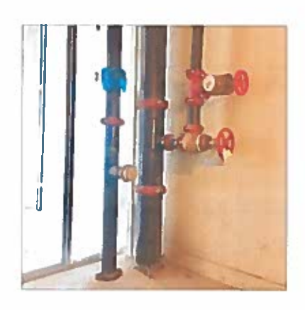
Four (4) fire sprinkler standpipes are installed (standpipe pictured in west-end staircase)