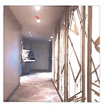
Hotel corridor specifications and a corridor mockup are complete