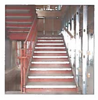
Three (3) additional staircases installed (from 2<sup>nd</sup> to 5<sup>th</sup>, 9<sup>th</sup>, and 49<sup>th</sup> floor)