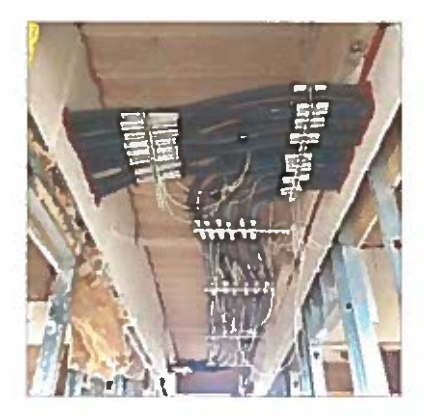
Mechanical rough - refrigerant piping is installed on 12 apartment floors