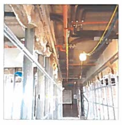
Fire sprinkler rough-in is installed on 7 apartment floors