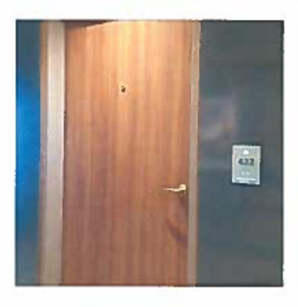
Hotel room specifications and two fully furnished model rooms are complete (No pictures allowed)