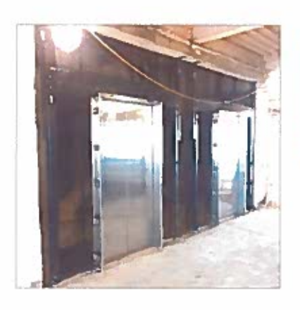
Elevator openings were cleared and new frames, sills and doors are installed on 15 floors