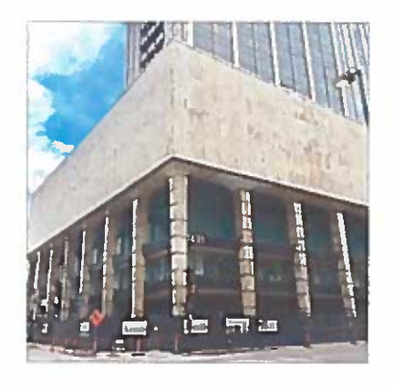
94% of the historic marble is removed. THC / NPS approved the refurbished marble mock installation (seen on the 3rd from right column crown)