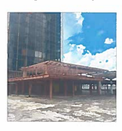
New steel structure is installed for restaurants and bars on the 75,000 sq.ft. amenity deck