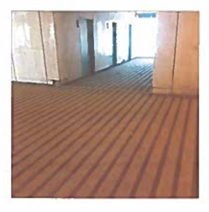
Old concrete was removed to install new flooring finish on fl. 9 (amenity level)