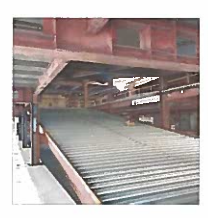
Floor cutouts were made and new steel ramps are installed from the street level to the added parking garage on fl. 6-8 (behind the windowless marble façade)