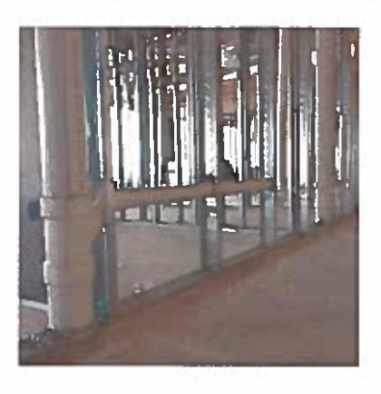
Plumping rough is installed and completed on 12 apartment floors