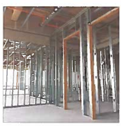
89% of steel unit separation wall framing is completed on 32 floors; 309 apartments and 174 hotel rooms have wall framing