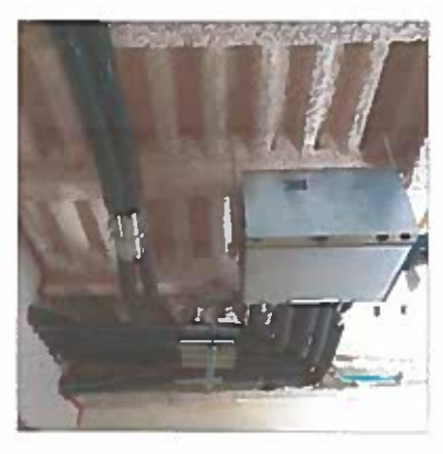
New fireproofing and fire safing (not pictured) is completed throughout the tower