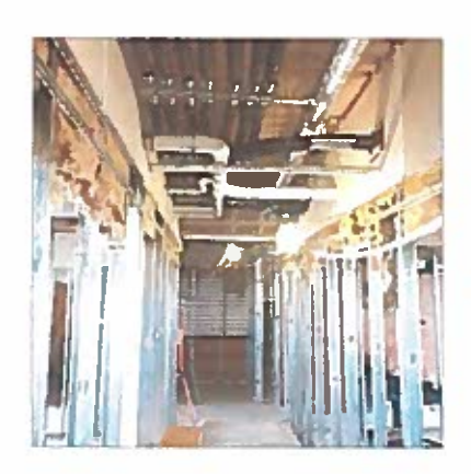
Dry wall, insulation, and fire tape at ceiling is completed on 17 apartment floors