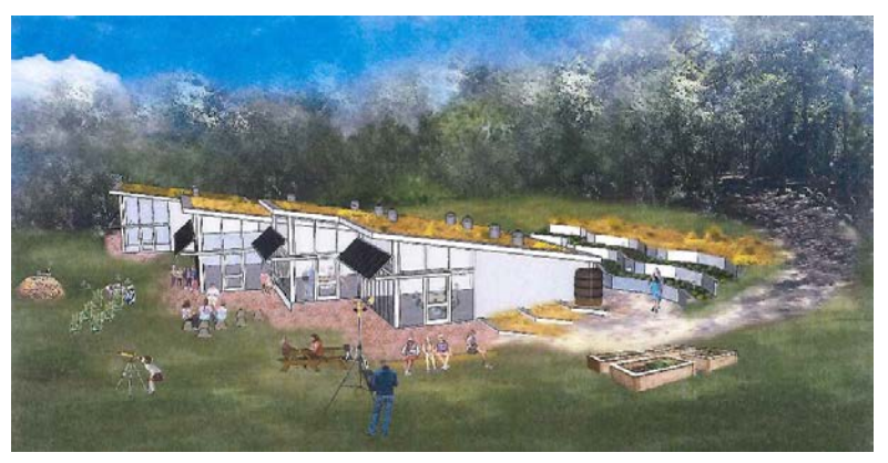
Girl Exploration Center