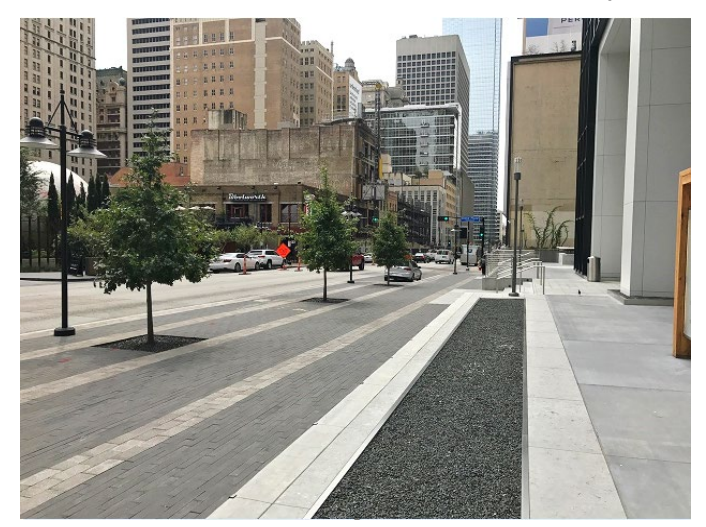
Thanksgiving Tower (1601 Elm Street)

Improved streetscapes and facades (public realm)