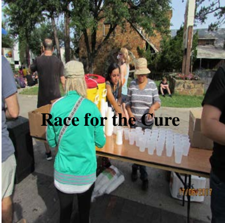
Race for the Cure