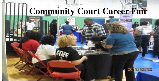
Community Court Career Fair