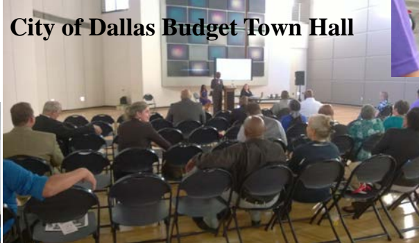
City of Dallas Budget Town Hall