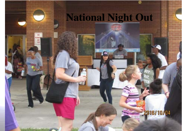
National Night Out