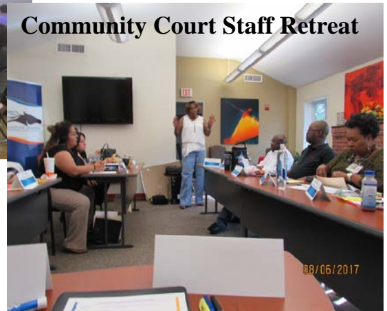
Community Court Staff Retreat