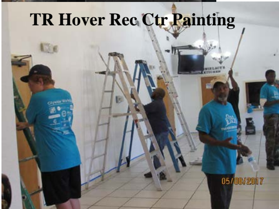
TR Hover Rec Ctr Painting