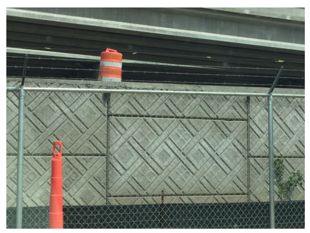
Retaining Wall Aesthetics