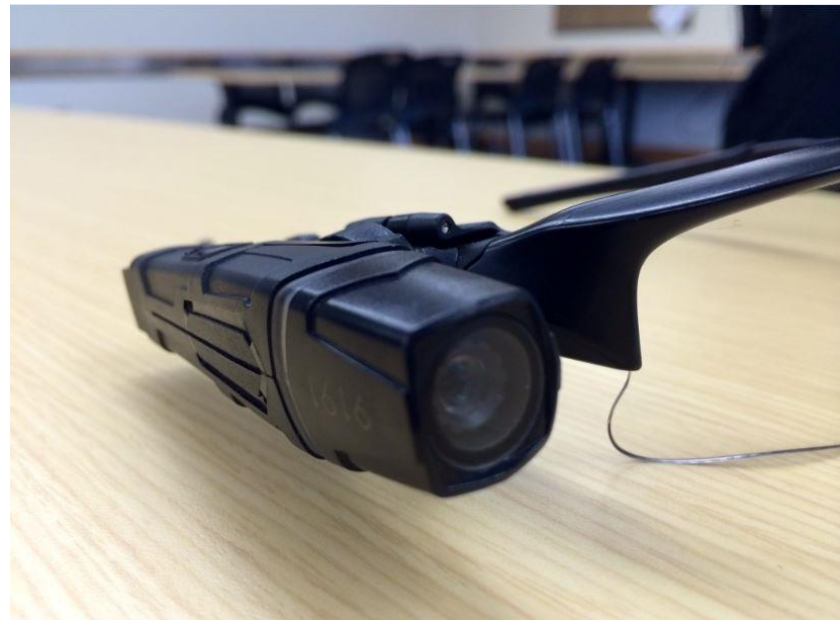
Taser Flex Camera