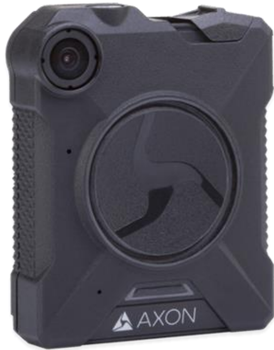
Axon Body 2 Camera