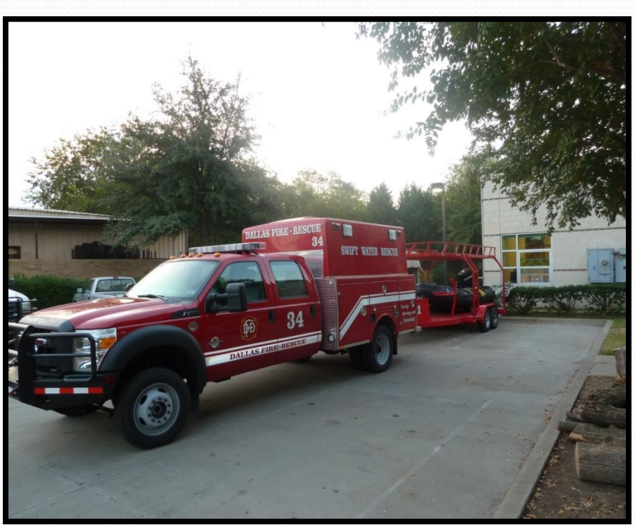
Trailer with Inflatable Boat