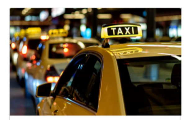
Theft of Service (Under $2,500) A person obtains a service without rendering proper payment for that service.