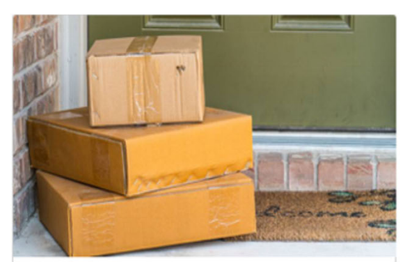
Theft (Under $2,500) Property taken belonging to another without the owner's permission

An offense if, without the effective consent of the owner, he recklessly damages or destroys property