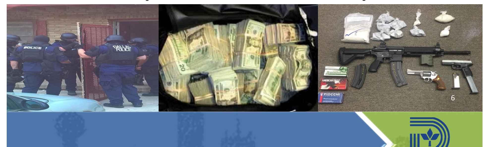
*In 2015 several large seizures were made as a result of federal task force investigations.