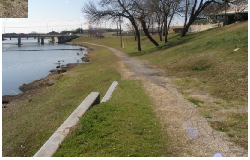
View west to Lemmon Ave