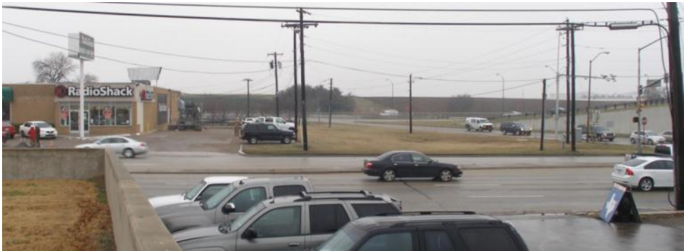
View south across W Northwest Hwy