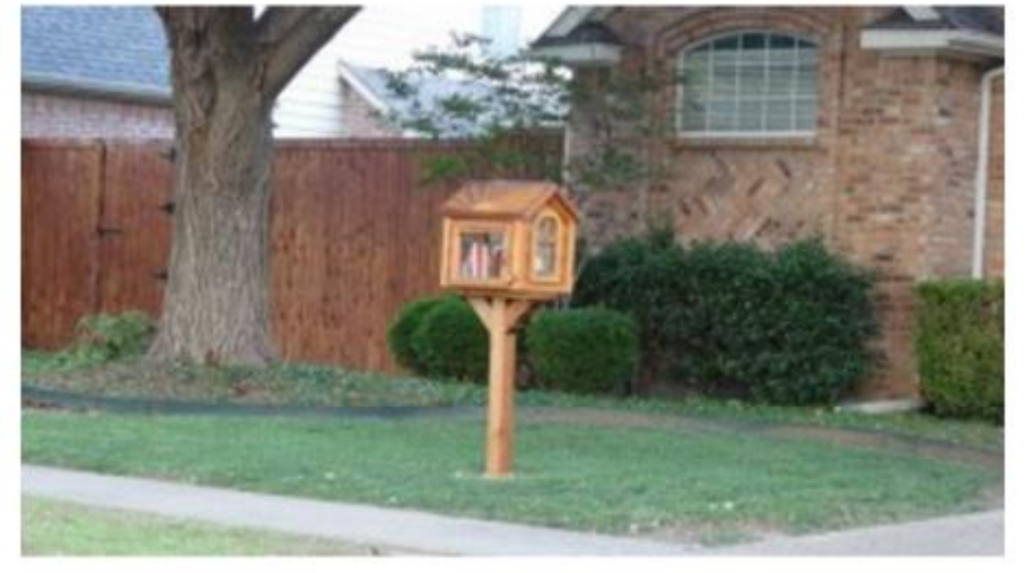
Little Free Library Number 9630 at at 387 Bedford Drive in Richardson, TX