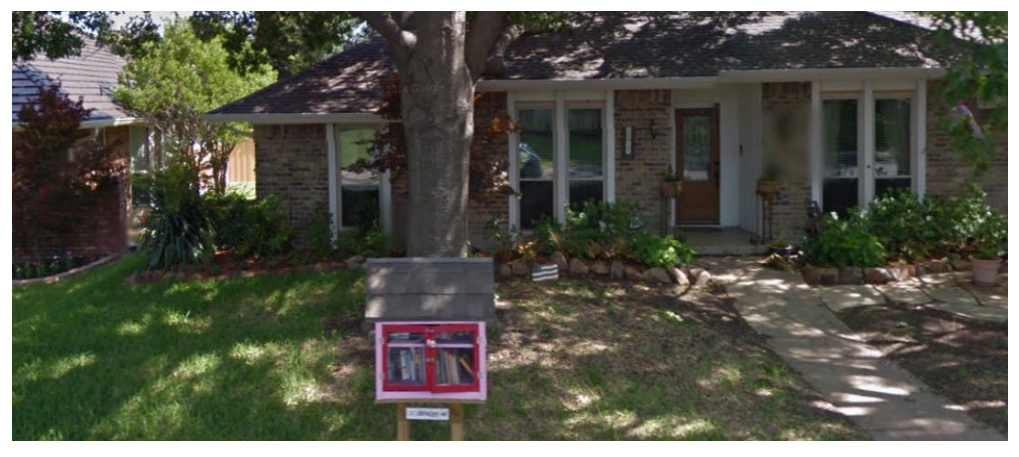
9614 Vista Oaks Drive