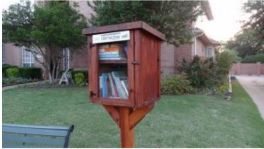
Little Free Library Number 8067 at 1811 Park Meadow Lane n Richardson, TX