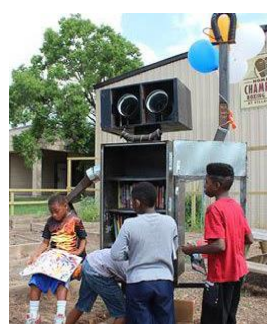
Village Oaks Apartments Little Free Library