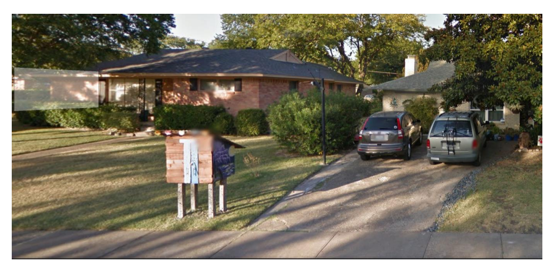
9210 Lynbrook Drive