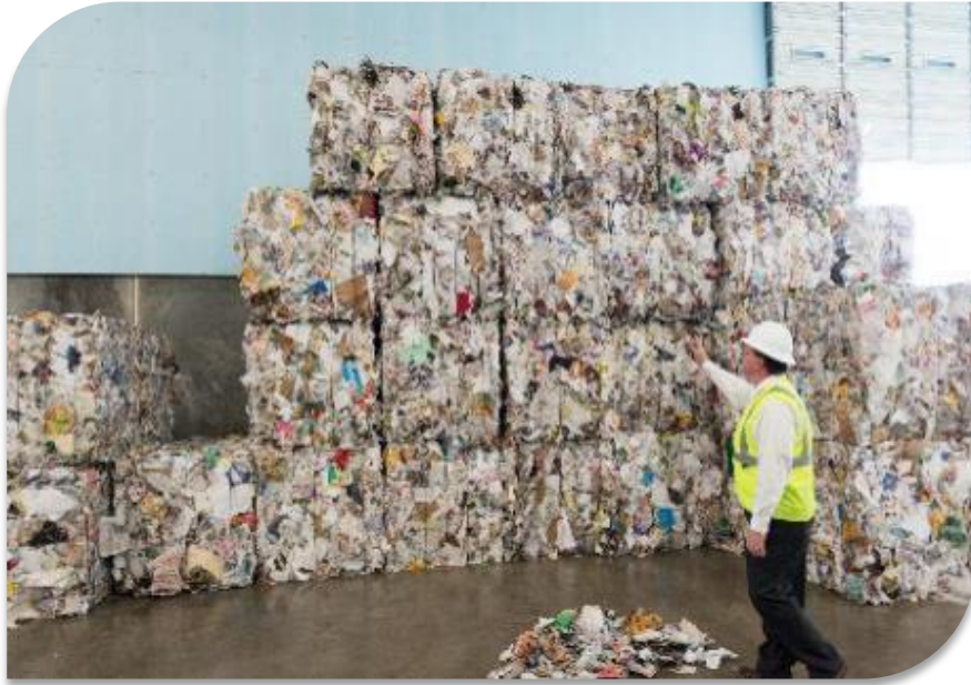
Mixed Paper Bales