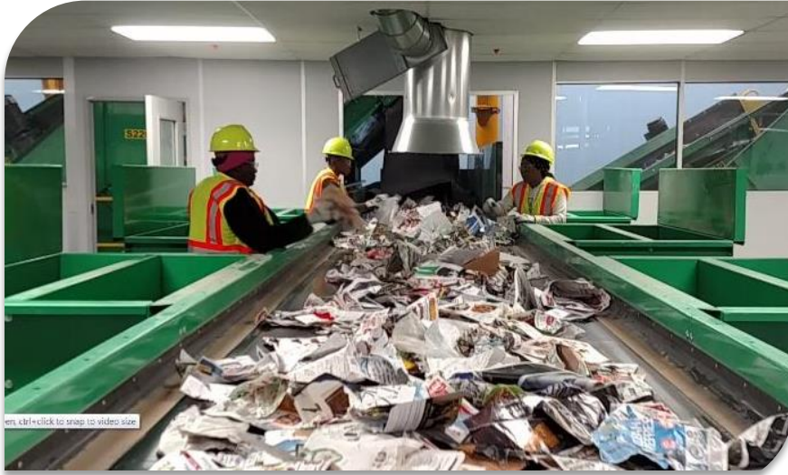
Paper Quality Control Sorting