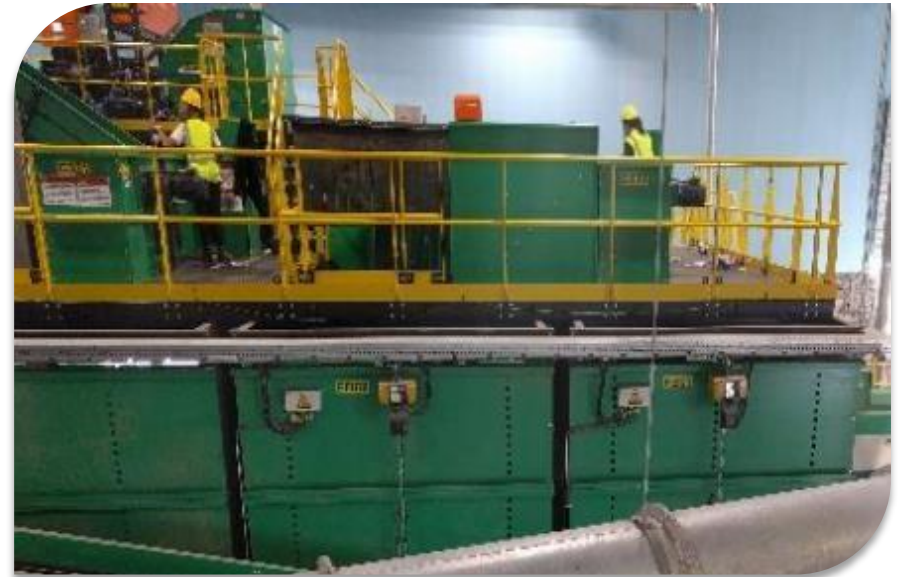
Container and Aluminum Sort