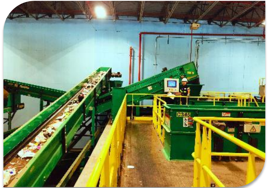
Conveyor to Optical Sort