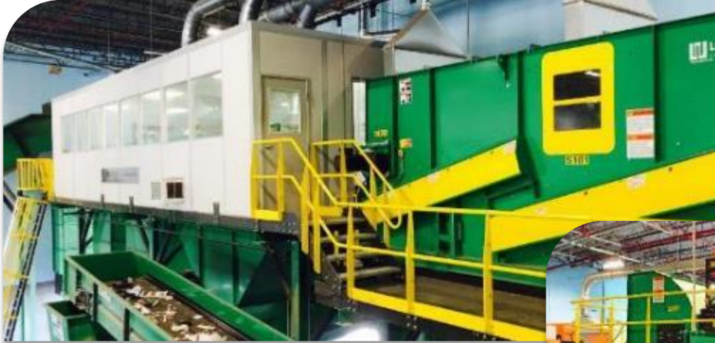
Climate Controlled Sorting Cabin