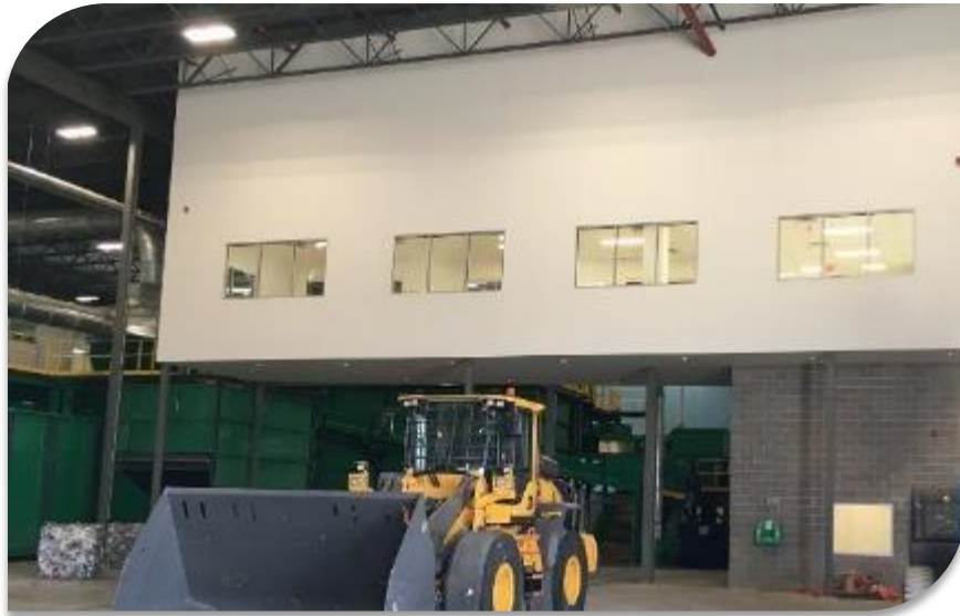
Tipping Floor/Viewing Gallery