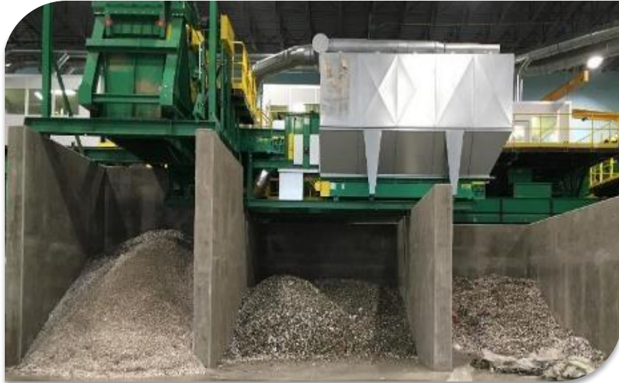
Glass Sorting System