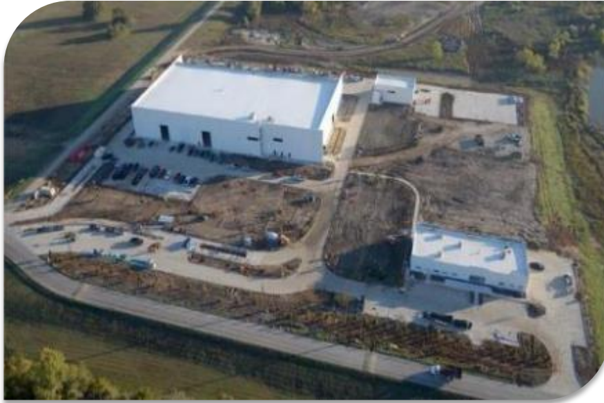
All Buildings Constructed