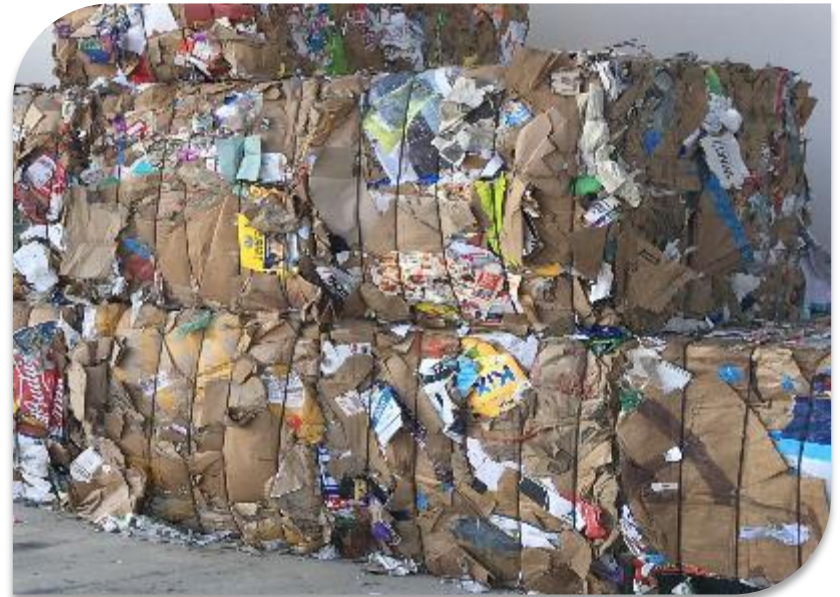
Corrugated Containers - "Cardboard"