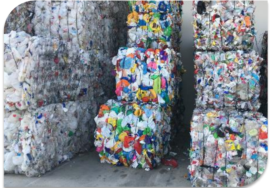
HDPE Natural & Color and Mixed Plastics