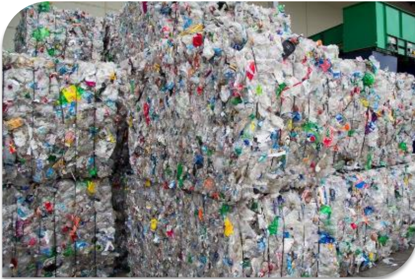
PET #1 Bales