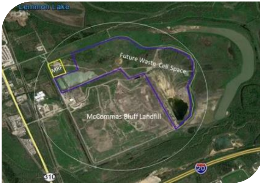
MRF Within the Landfill