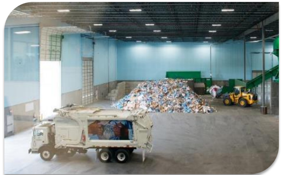
Tipping Floor View From Gallery