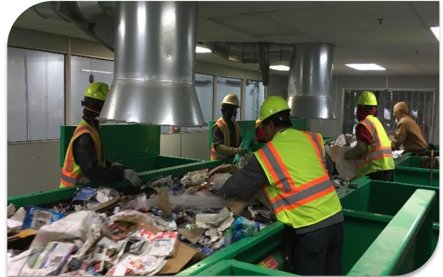
Paper Quality Control Sorting