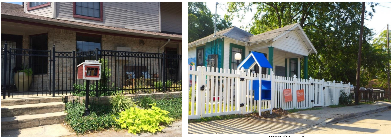
3236 Basil Court