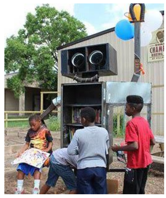
Village Oaks Apartments Little Free Library