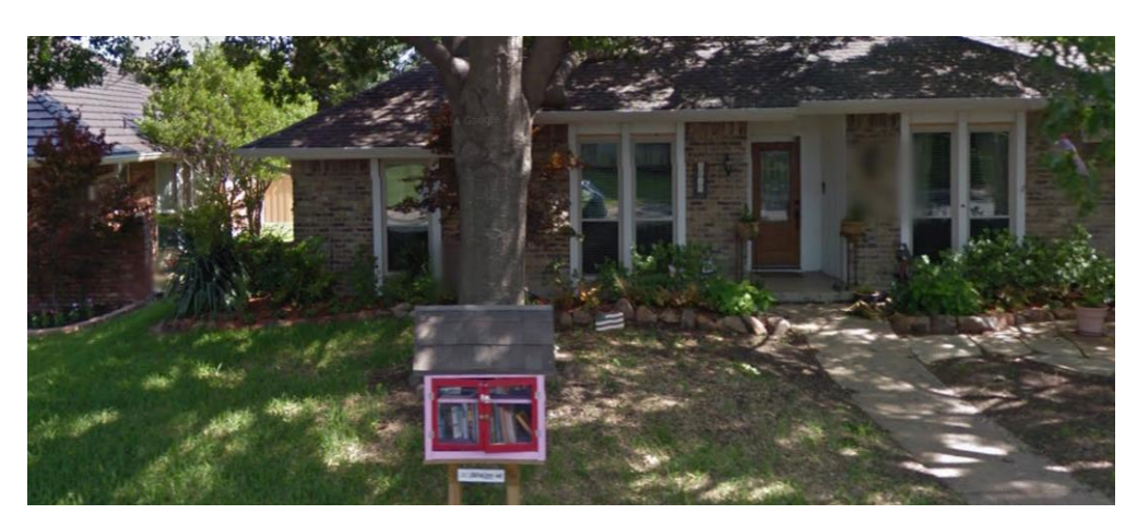
9614 Vista Oaks Drive