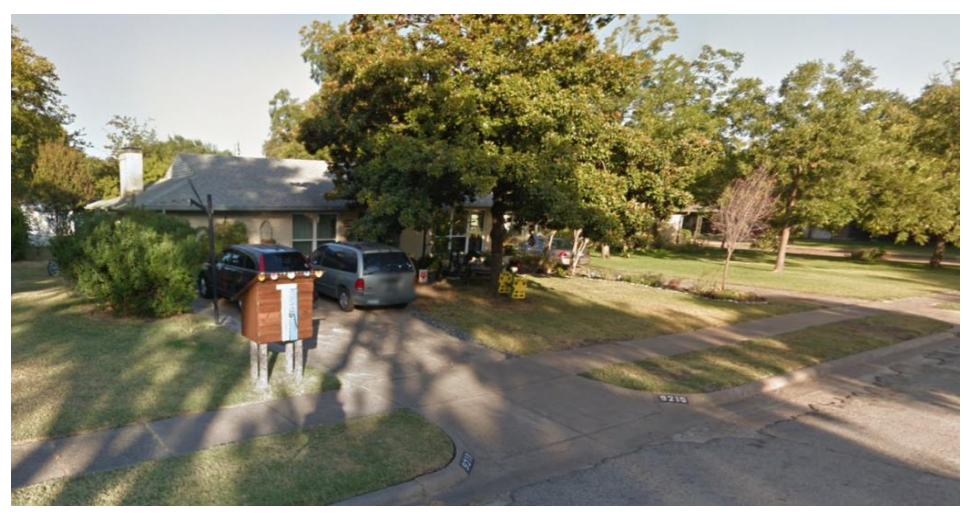
9210 Lynbrook Drive