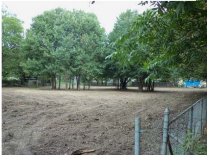
414 Bridges – After