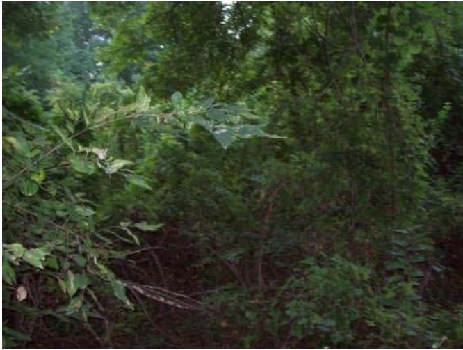
414 Bridges - Before