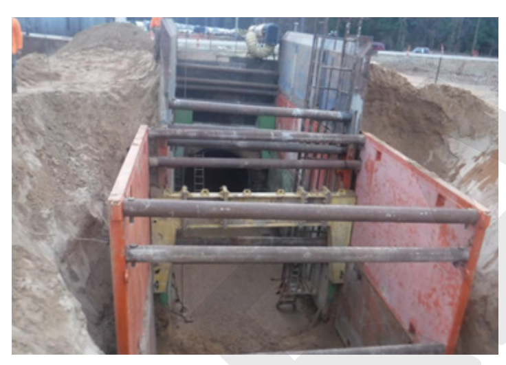
PL19TX Completion of launch shaft extension at SH 19