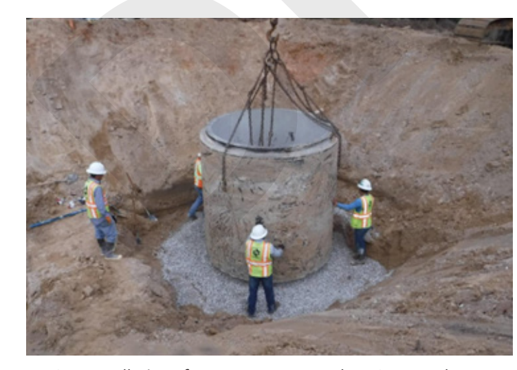
PL19TX Installation of access manway vault at Crossroads Dr.