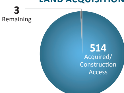
Total Parent Parcels: 517