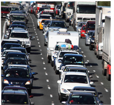
"We should reduce traffic congestion"