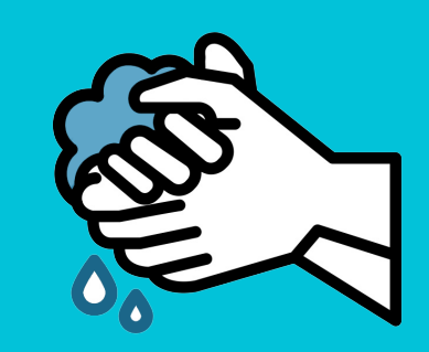
Wash with soap and water for 20 seconds or use hand sanitizer.