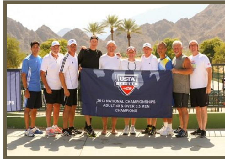
2013 3.5 Over 40 Men National Champions