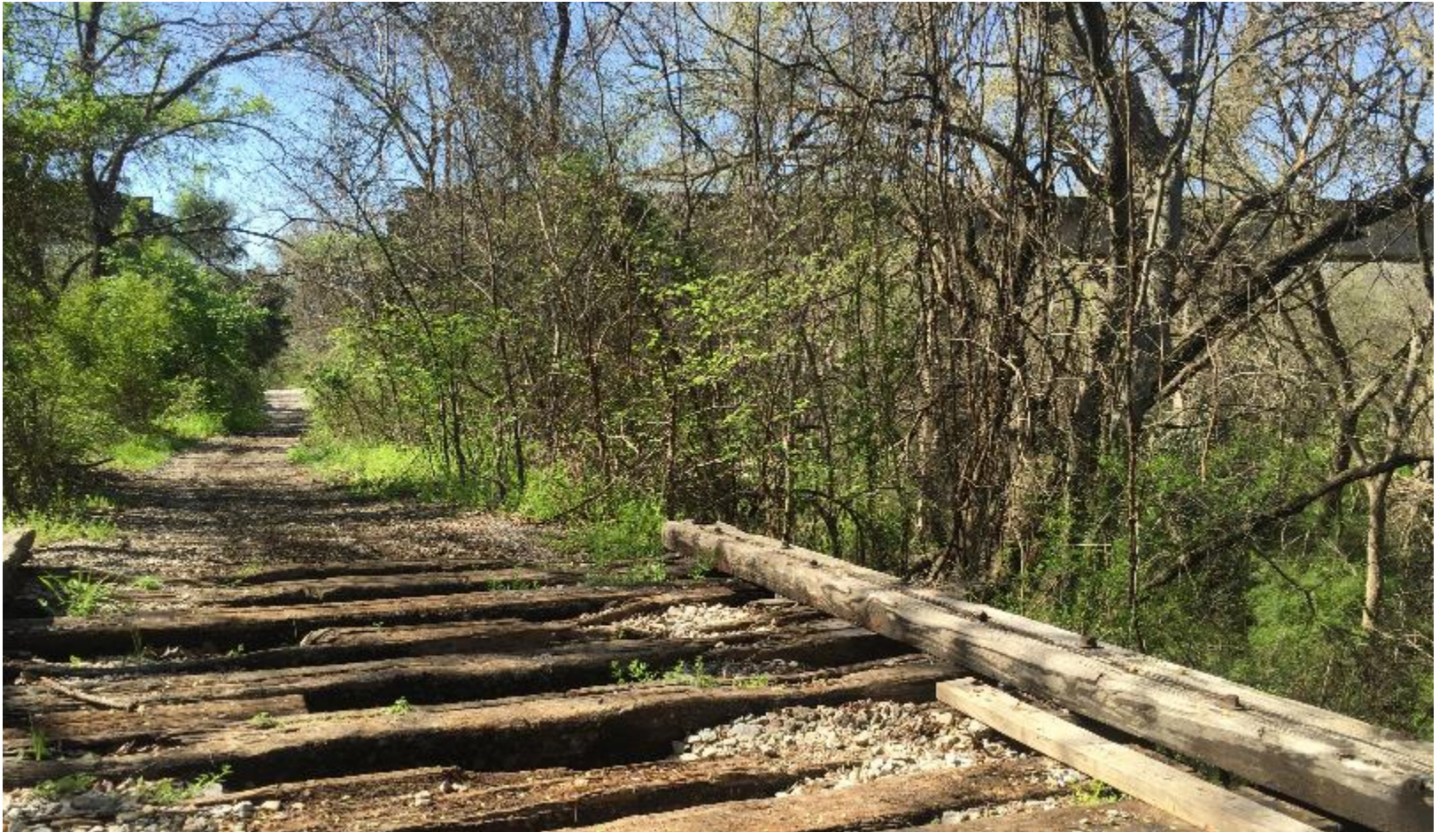
Chalk Hill Trail, Dallas | 33 Acres