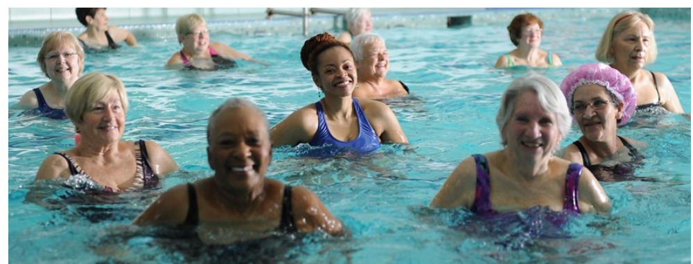
Operator for Off-Season Pool Use Park and Recreation Board October 18, 2018