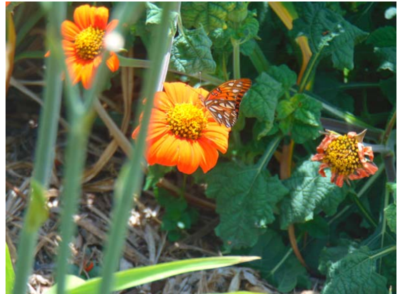
Photograph taken by youth participant Nature Photography program at Kiest Recreation Center