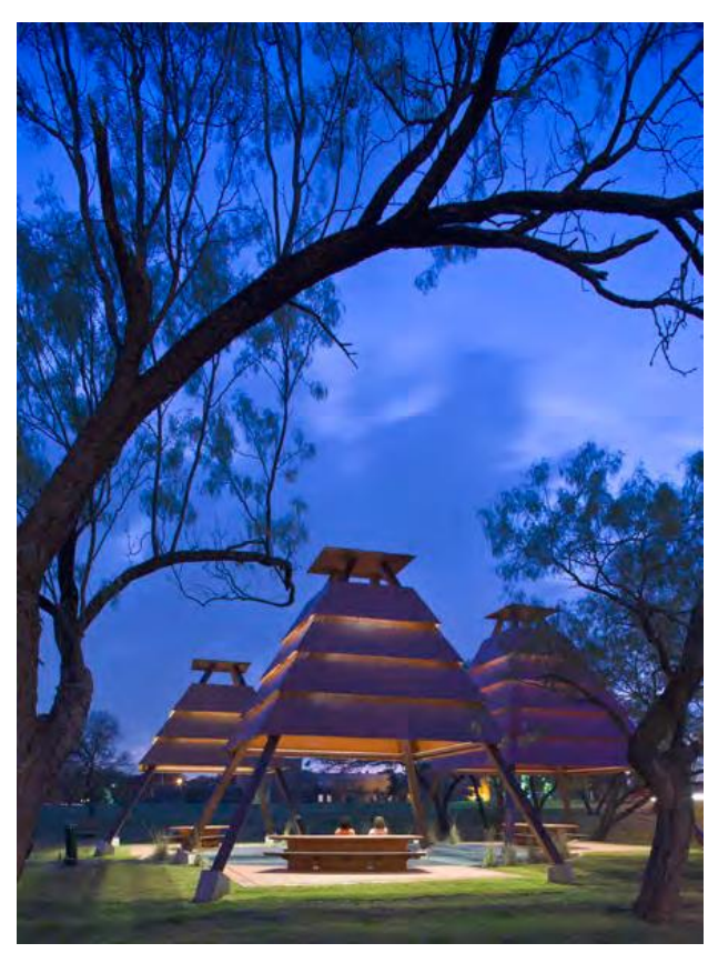
Park and Recreation Board August 17 2017