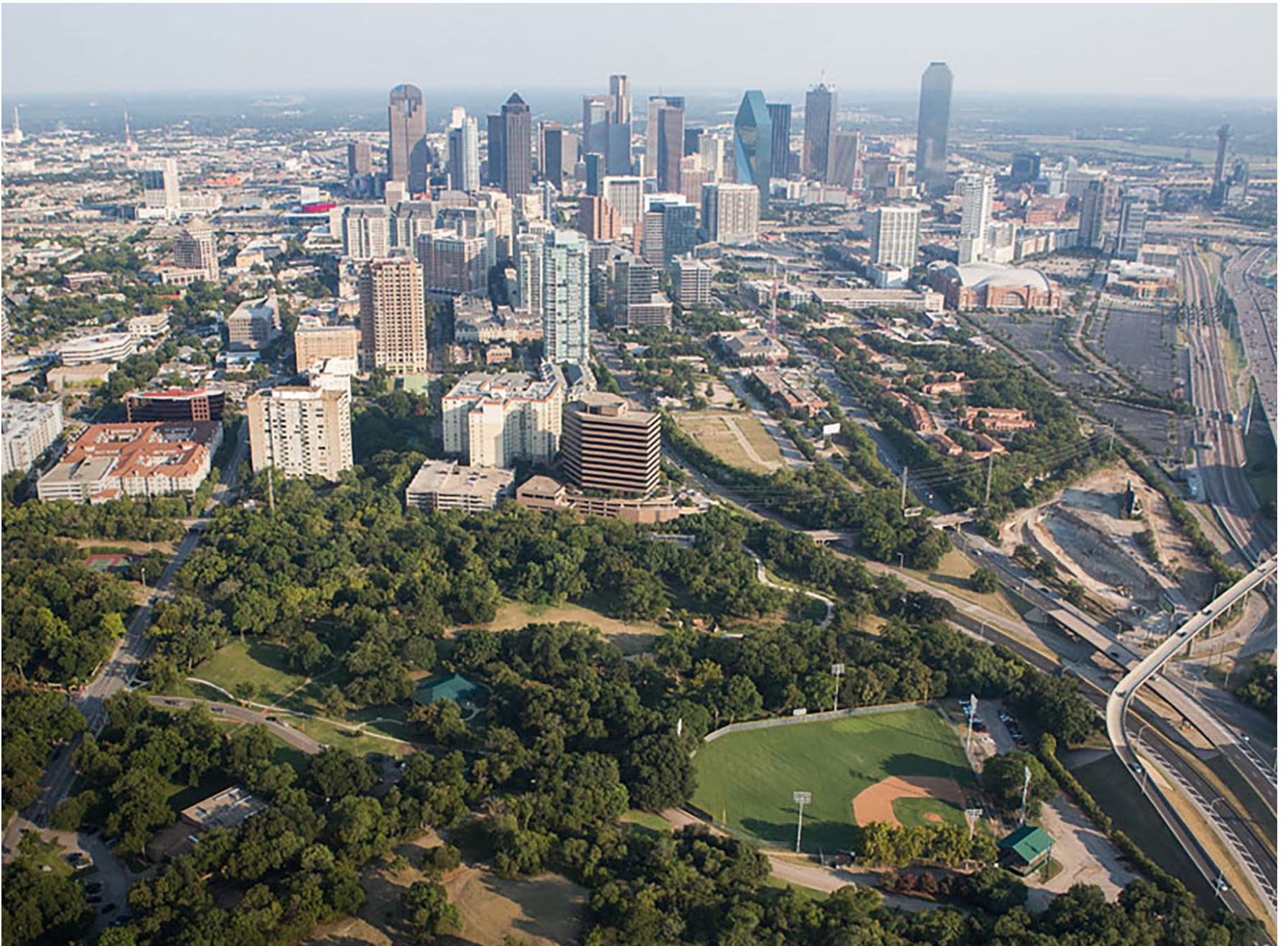
23 Dallas Park & Recreation