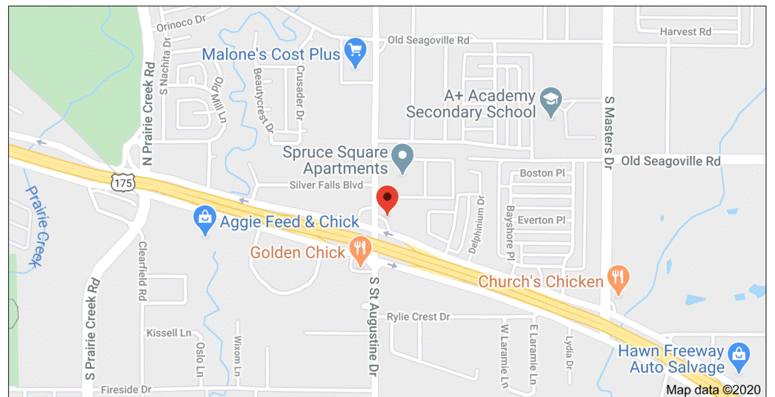
2 VICINITY MAP FOR REFERENCE ONLY